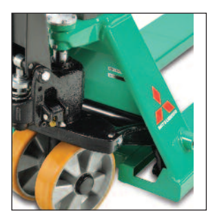
Controlled lowering valve